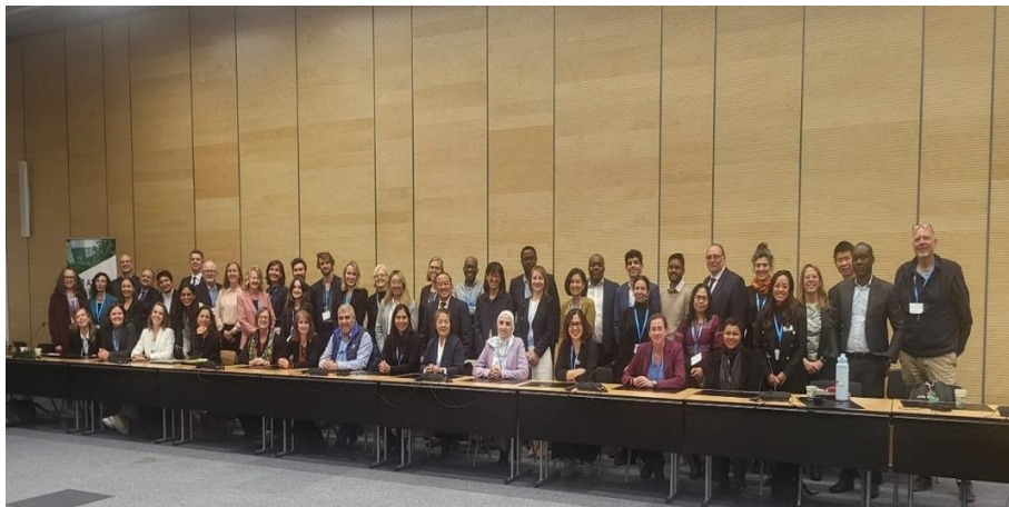
Photograph of the participants of the consultation

There has been a growing demand from member states to address these environmental and climate risks linked to health sector operations both within health systems and international agencies. WHO has established health guidance and standards for medical products, with efforts underway to integrate sustainability criteria. Global mandates, including the COP26 Health Programme commitments through the Alliance for Transformative Action on Climate and Health (ATACH) and the Global Framework on Chemicals for a planet free of harm from chemicals and waste (GFC) , emphasize the need to work towards climate-resilient, low-carbon health systems and responsible chemical management globally.